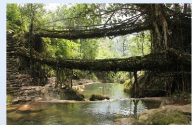
Unique living tree-root bridges of India illustrate the power of unity and growing together.