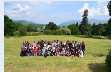
Lovely Lake District provides an ideal setting for retreat