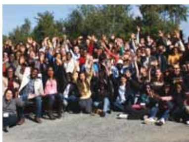
Above: Having a great time at the Singles' Retreat in Wales, September 2009.

There is much more to look forward to. The representatives of each London singles ministry, through prayer, have drawn up a calendar for the rest of the year filled with exciting events, including, amongst others, the March invitational service, 'Why Shouldn't I Get Baptised' and October's retreat; all of which seek, in unity and love, to build up the body of Christ and present an opportunity for a seed to be sown in the lives of those that are seeking God in their hearts. To find out more about what is going on have a look at the singles page on the ICCM site: www.icoc.org.uk/singles